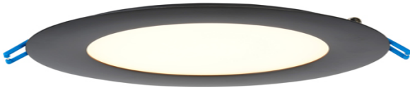
Type IC, Wet & Air-Tight