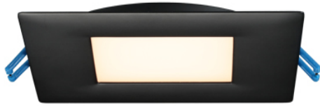
Type IC, Wet & Air-Tight